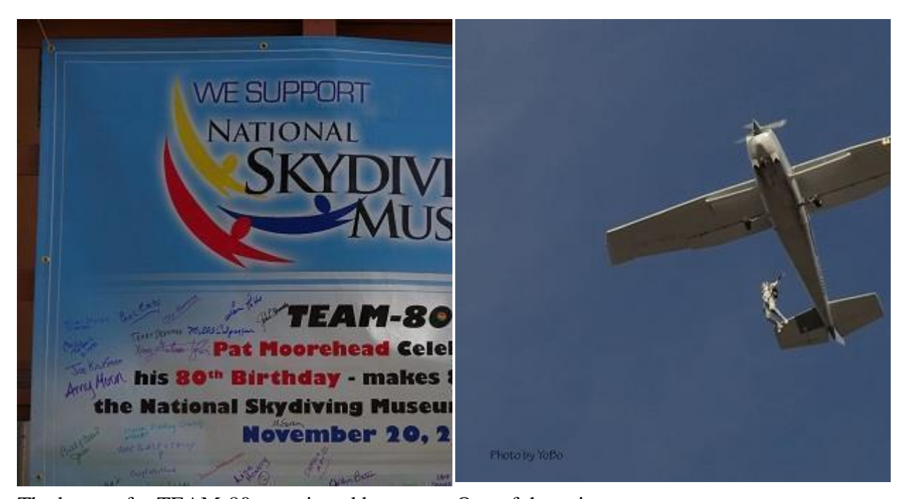
The banner for TEAM-80 was signed by many One of the exits. of the crowd.