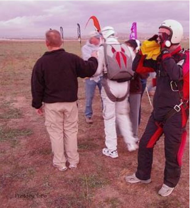
Dawn breaks and the TEAM-80 action begins.