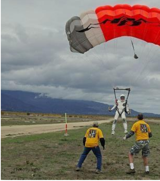
An on target landing with the rigging team ready to retrieve the equipment.