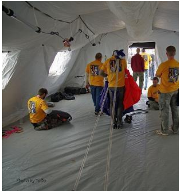
The packing team at work in the shelter.