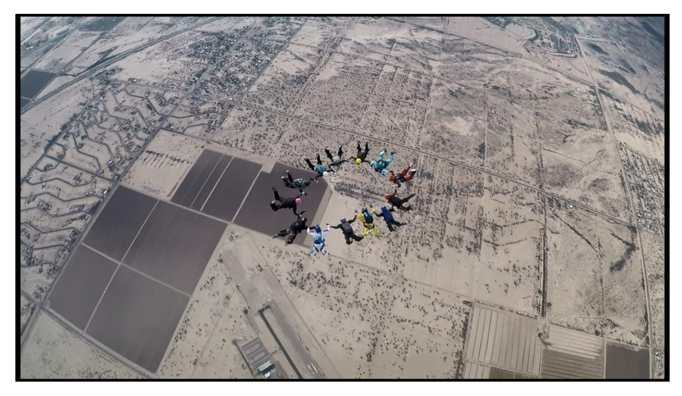
TBM records, 22 Dec 2018, Eloy, AZ Parachutists article "Winter Hot Flashes"

The temperature was chilly but the smiles and hearts were warm, as the ladies of POPS racked up FIVE new records, to include a new TBM POPS WORLD record making a 5point 12way!