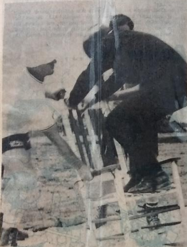
IS THIS HIT AND ROCK? - A member of the 82d Airborne Division Sport Parachute Club jumping in the "Hit and Rock" competition of the POPS (Parachutist Over Phorty) Meet gets into the chair quickly, but not necessarily correctly during the Meet Aug. 2-3. POPS 75 was sponsored by the 82d Sport Parachute Club and was held on Sic. Mere Egline Drop Zone at Ft. Bragg.

Warm handshakes, the loud shouts of greetings to an old jumper, a good cookout with cold beer to wash down the food and the eve of the POPS 75 Parachute Meet at Ft. Bragg was a complete success.